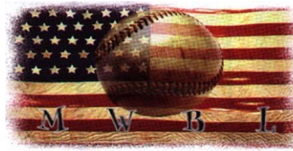
MID-WEST BASEBALL LEAGUE

ownership. With that wide range of ownership comes a great amount of knowledge, enthusiasm and dedication to baseball which makes the MWBL shine above other fantasy (alternative reality) baseball Leagues.