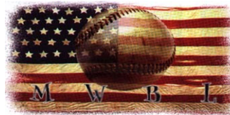
MID-WEST BASEBALL LEAGUE

ownership. With that wide range of ownership comes a great amount of knowledge, enthusiasm and dedication to baseball which makes the MWBL shine above other fantasy (alternative reality) baseball Leagues.